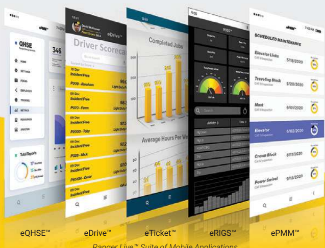
eQHSE™ eDrive™ eTicket™ eRIGSTM™ ePMM™ Ranger Live™ Suite of Mobile Applications